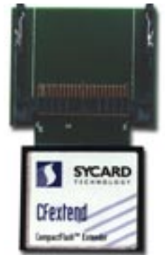
CF extend 162

The CF extend 162E provides an integral ejector mechanism and is designed for applications that require frequent card insertion/removal or physical card protection.