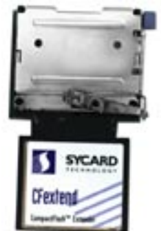
CF extend 162E